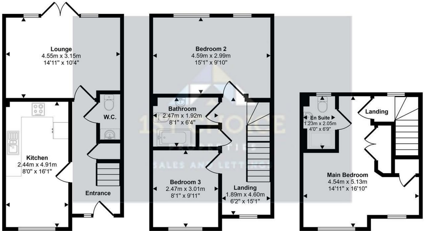
Ground Floor Approx 36 sq m / 387 sq ft

Approx Gross Internal Area 95 sq m / 1018 sq ft